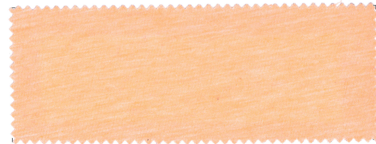
23527 / RPCM