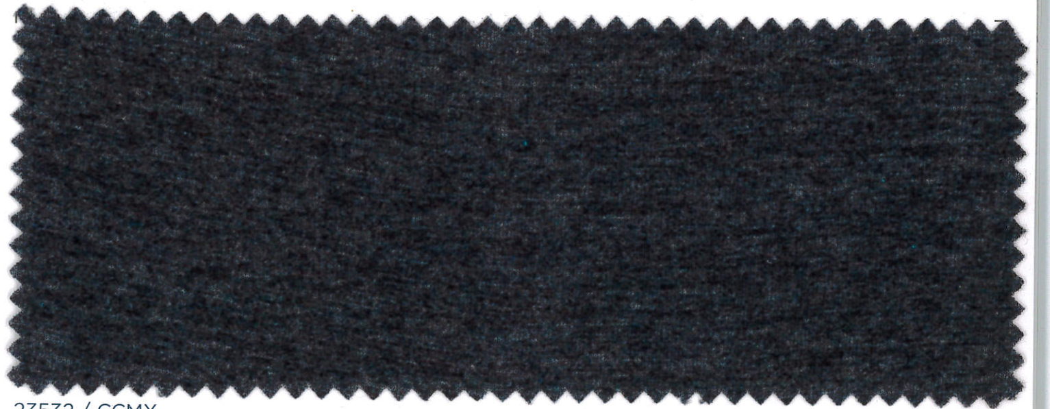
23532 / CCMX