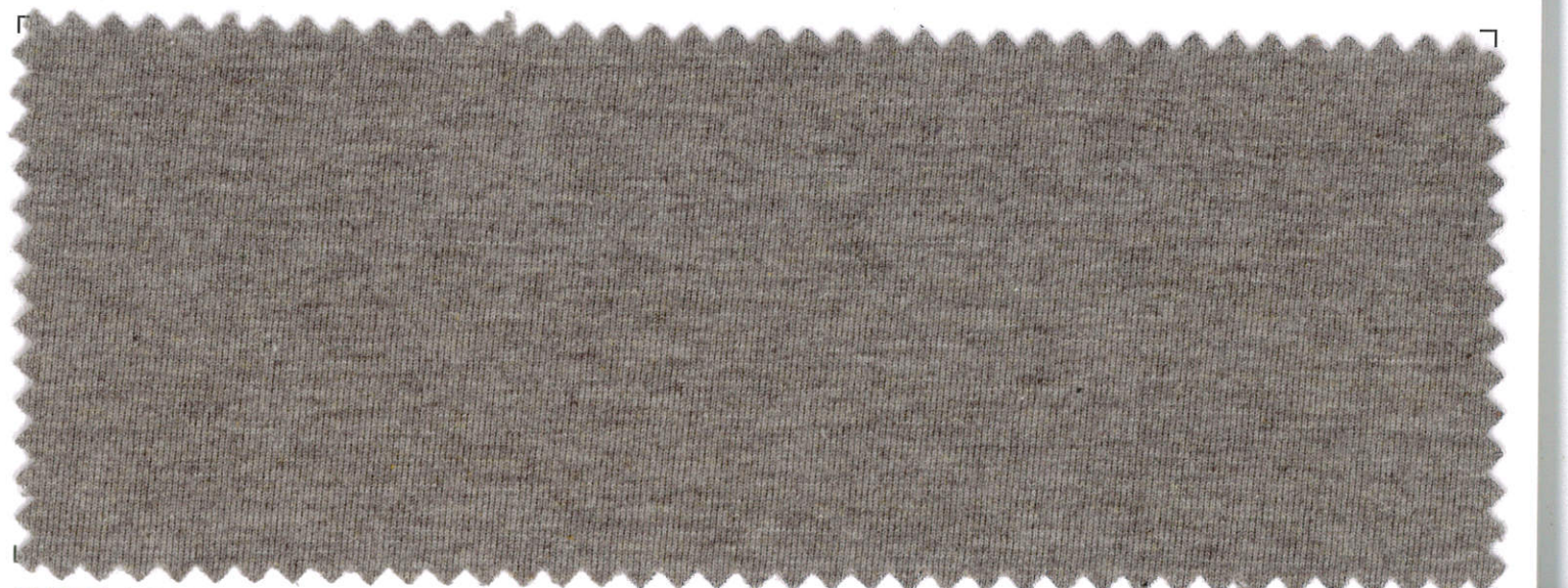
23533 / CCMX