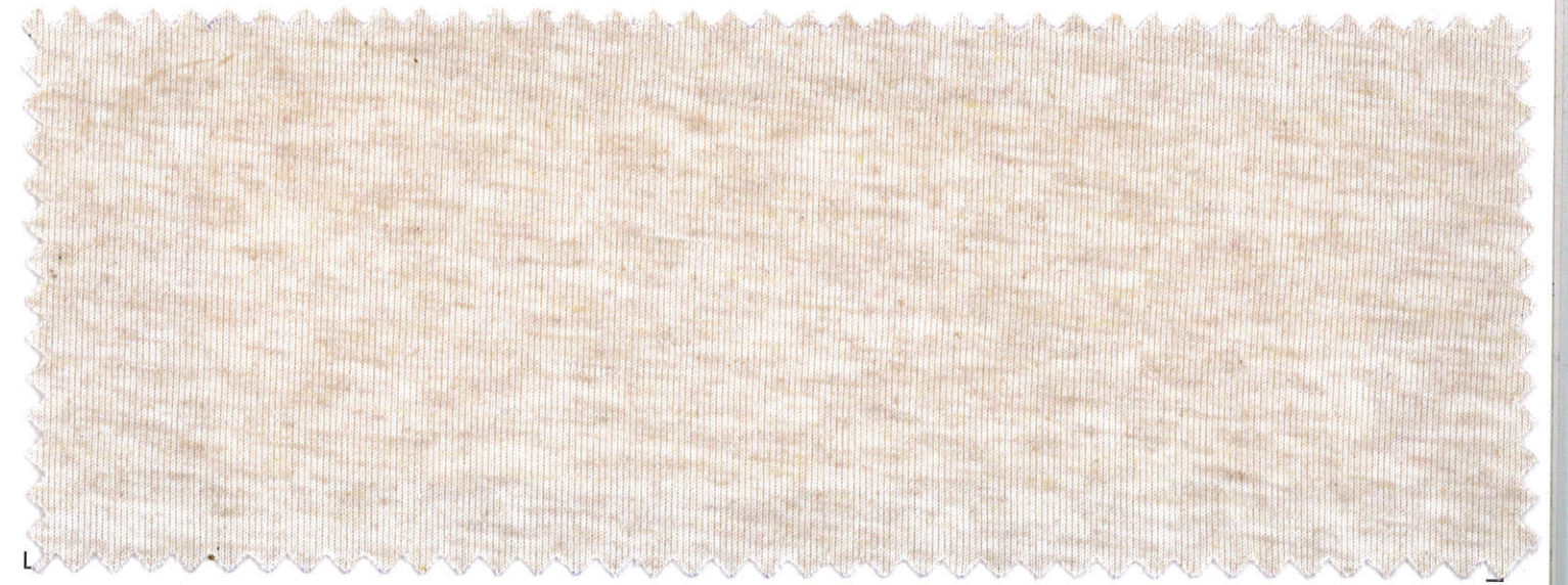
23530 / CCMX