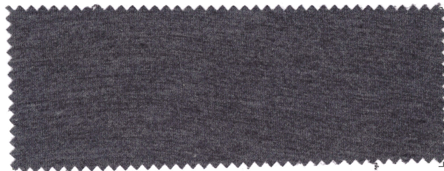
23526 / RPCM