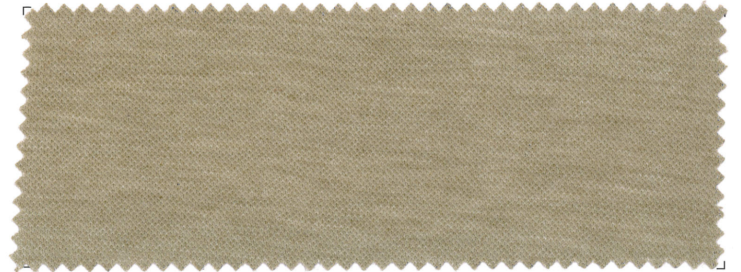
23528 / VLCM