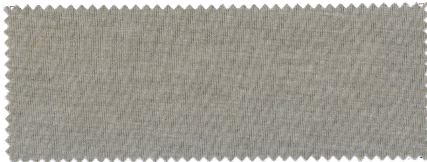
23525 / RPCM